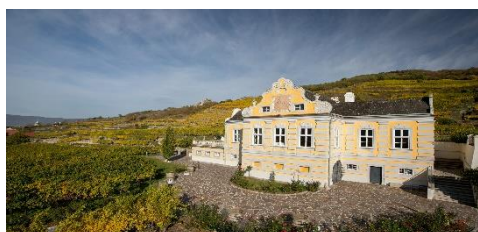
BAROQUE CELLAR PALACE