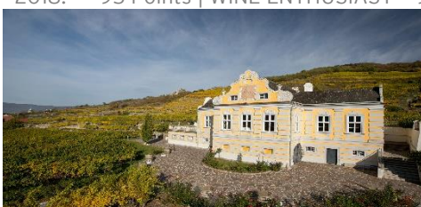
BAROQUE CELLAR PALACE

Alcohol: 13,5 % | Acidity: 7,4 ‰ | Residual Sugar: 3,4 g/l