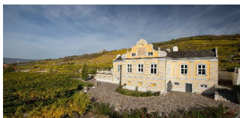
BAROQUE CELLAR PALACE