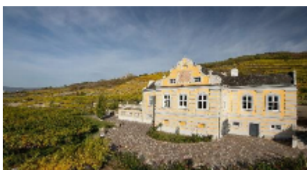
BAROQUE CELLAR PALACE

Alcohol: 13,0 % | Acidity: 7,5 ‰ | Res. Sugar: 2,7 g/l