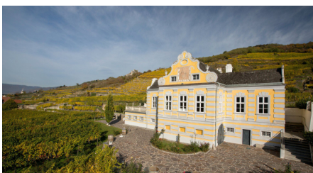
BAROQUE CELLAR PALACE

Alkohol: 13,0 % | Säure: 5,4 ‰ | Restzucker: 0,7 g/l